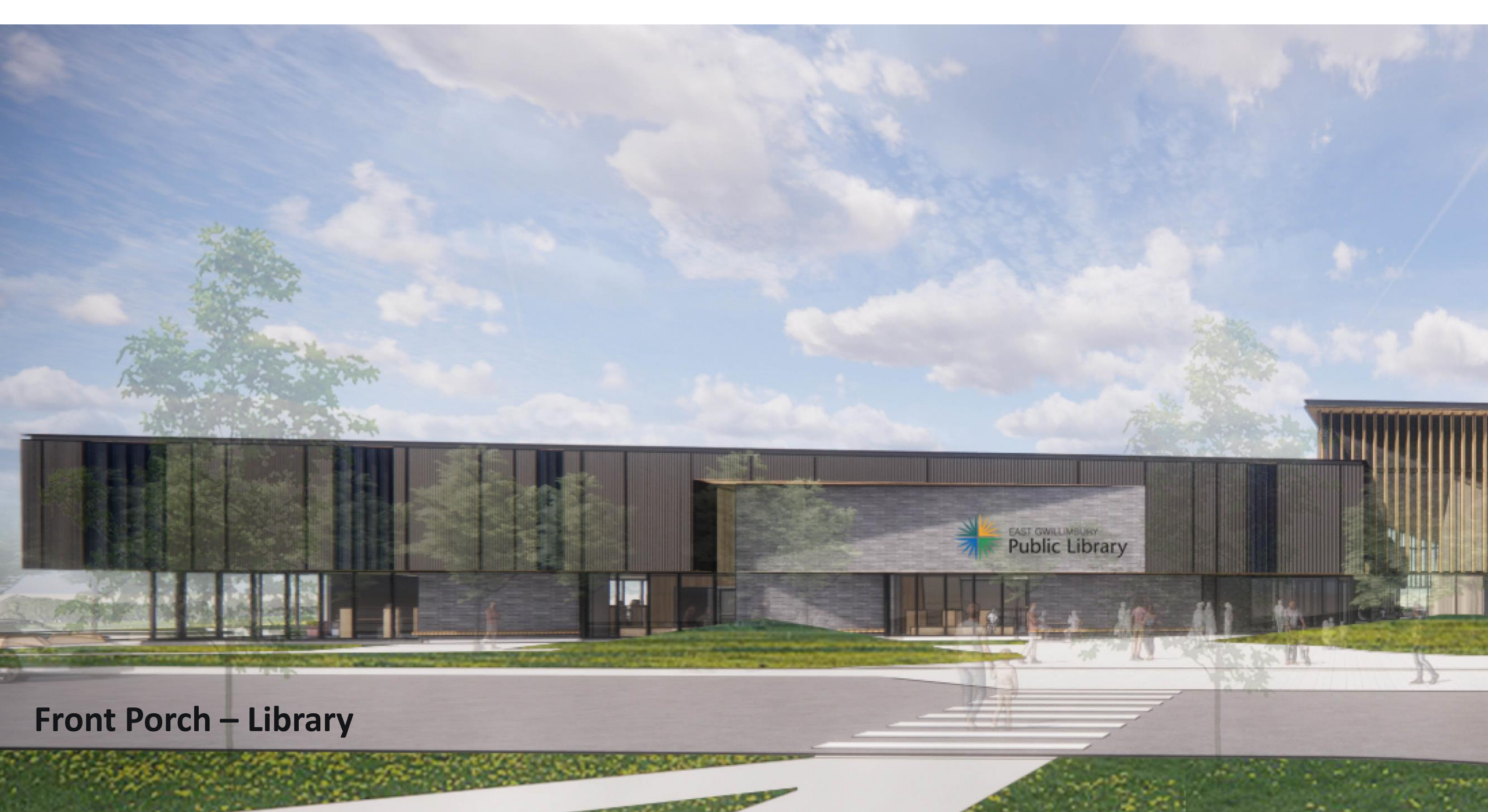
Front Porch – Library