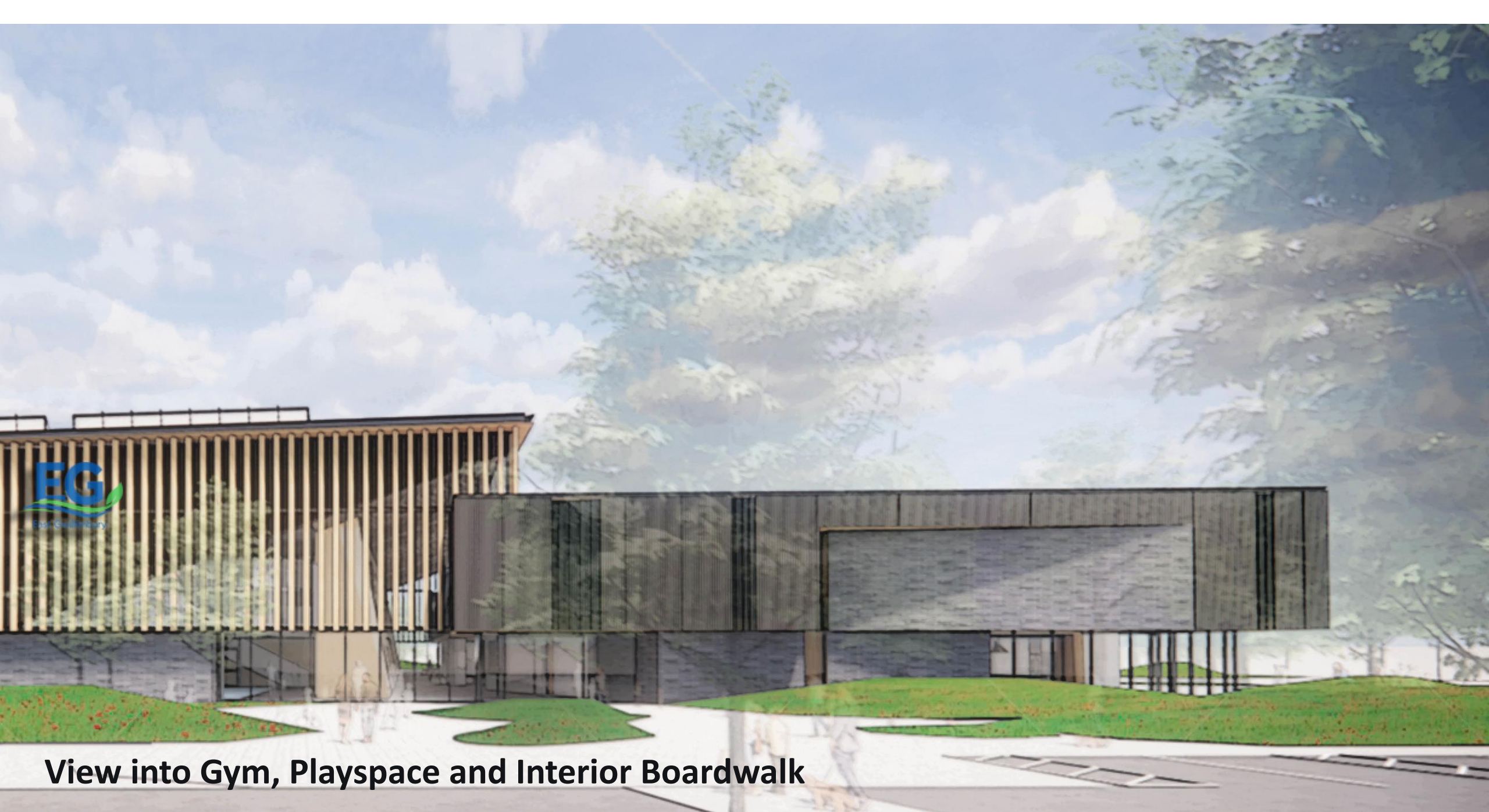
View into Gym, Playspace and Interior Boardwalk