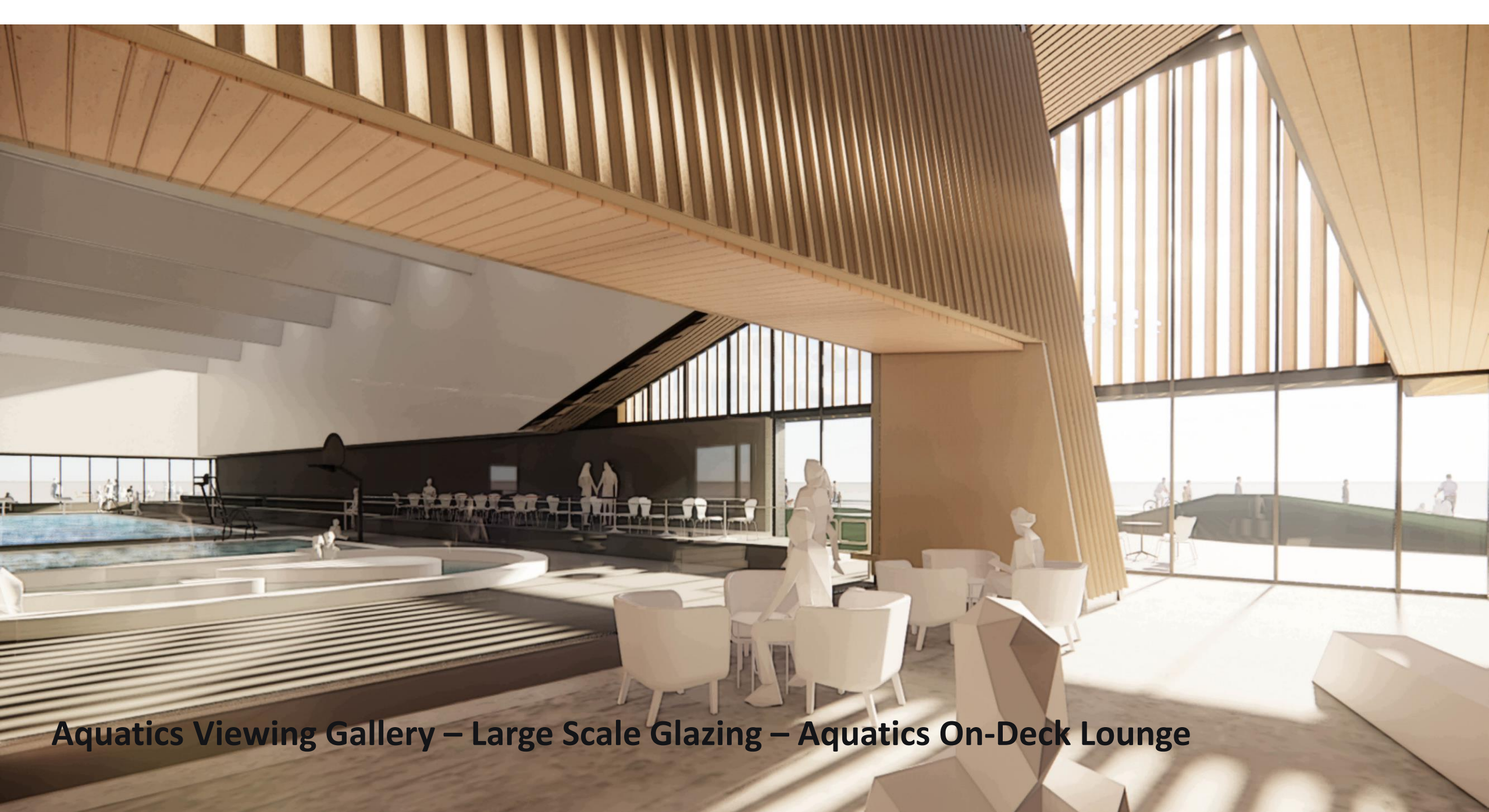
Aquatics Viewing Gallery – Large Scale Glazing – Aquatics On-Deck Lounge