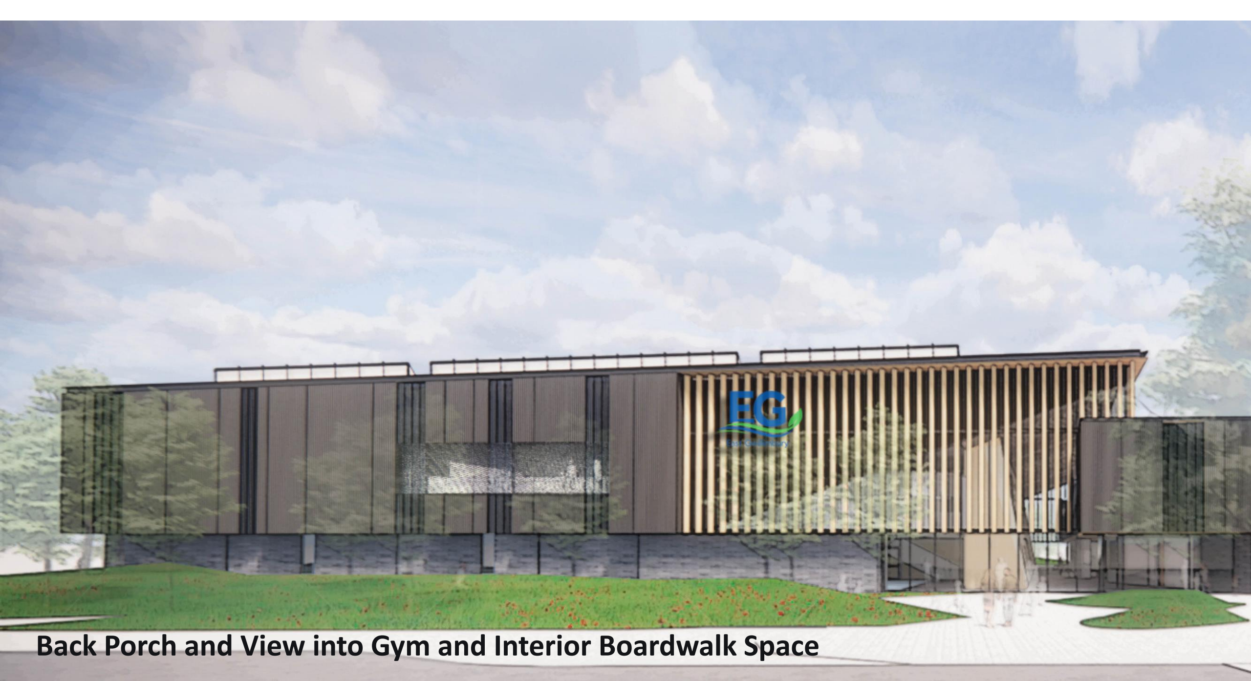
Back Porch and View into Gym and Interior Boardwalk Space