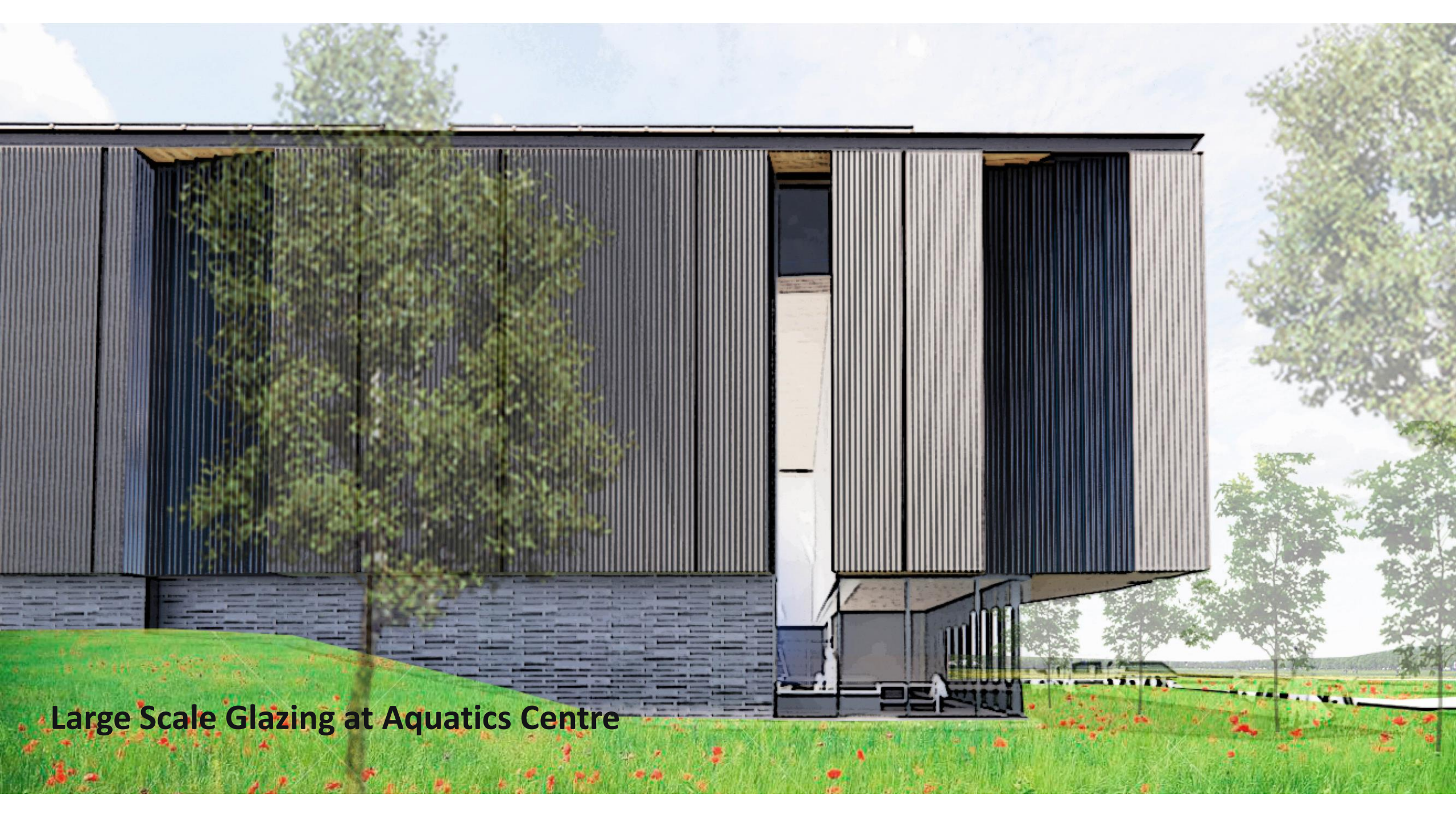
Large Scale Glazing at Aquatics Centre