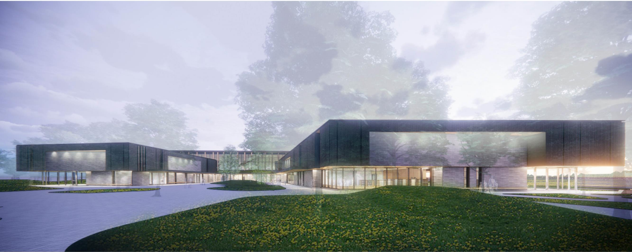
South View into Courtyard Space and Parkland Parkland to include Playgrounds, Community Garden, Outdoor Kitchen and Reading Gardens