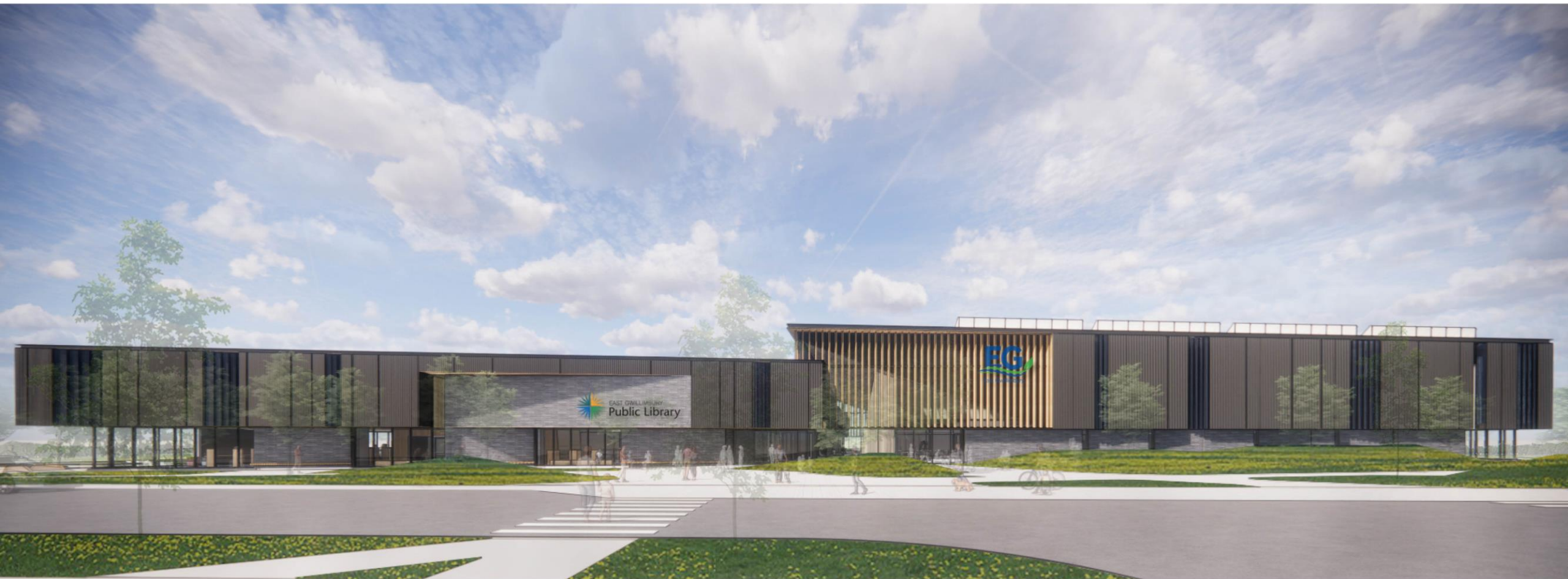
Front Porch and View from Mixed Use Development