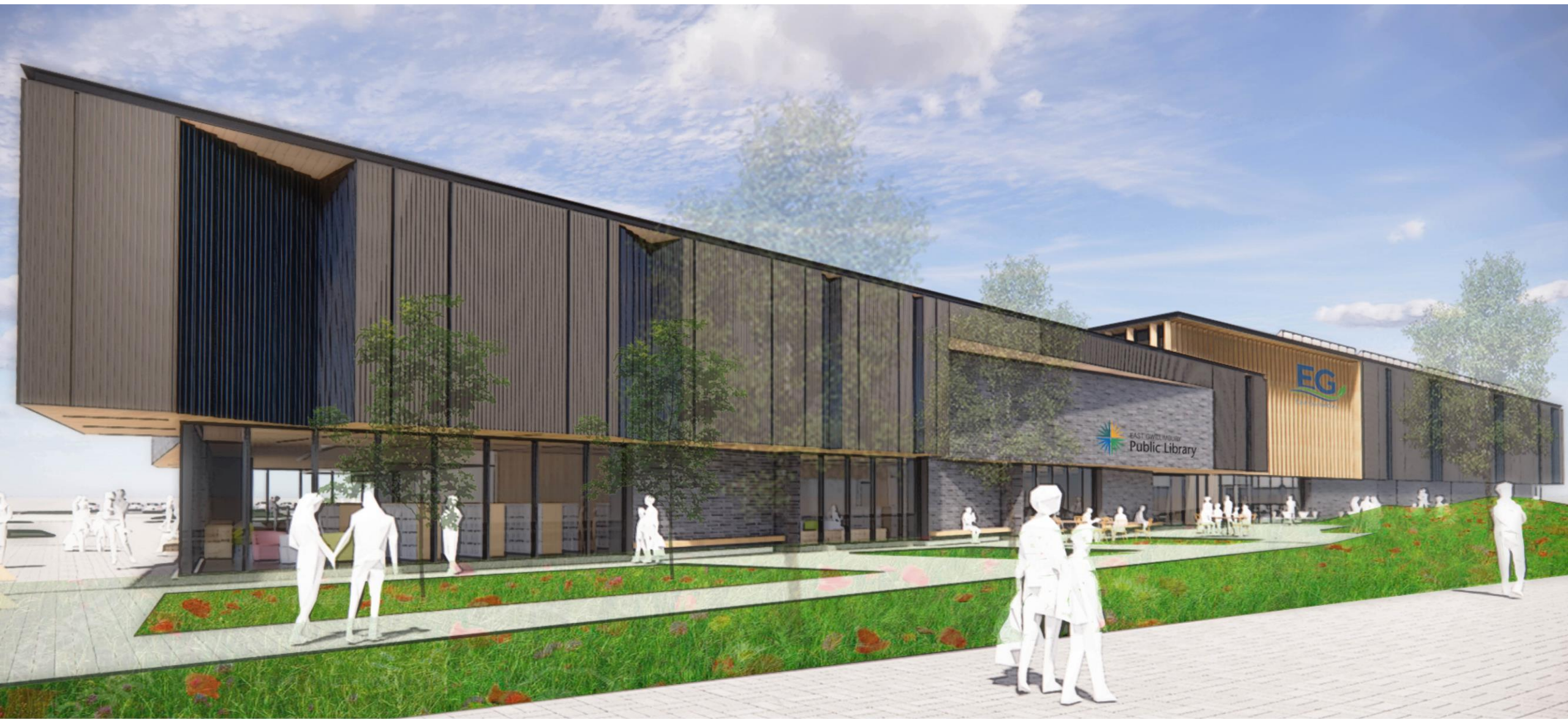
Front Porch - Exterior Boardwalk