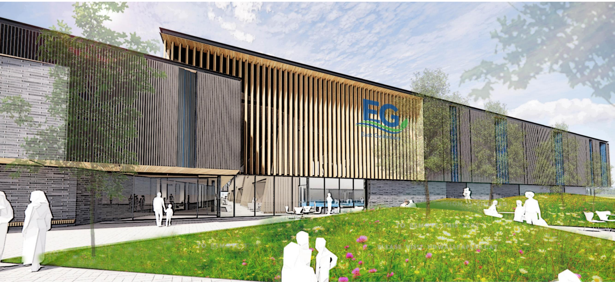
Front Porch – Windows into Library and Aquatics Centre