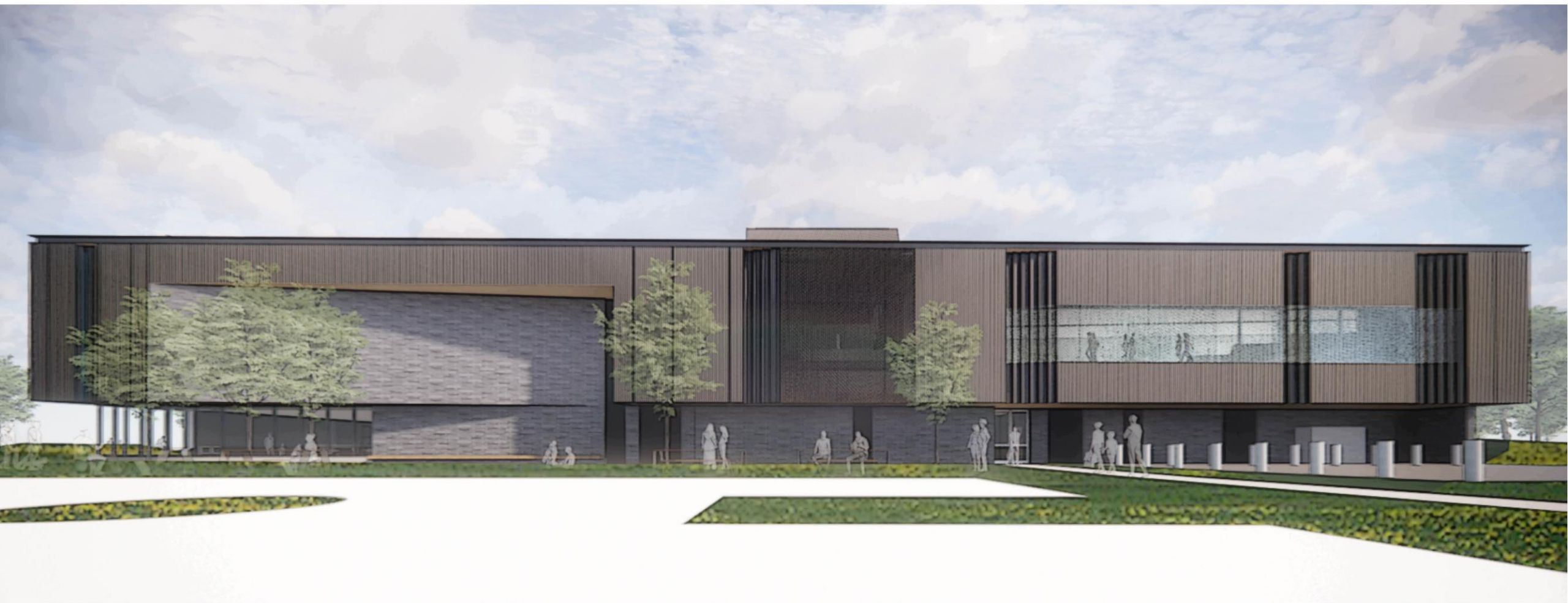
North Elevation with Views into the Aquatics Centre and Gymnasium from Park