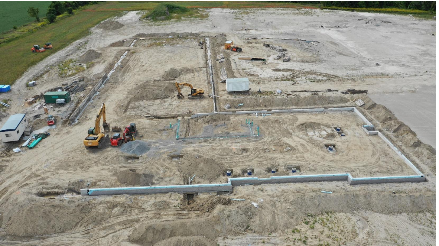
Aerial view looking west of Operations Centre building footprint