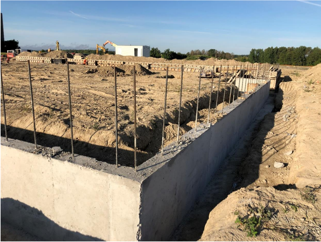
Foundation wall along N/E elevation