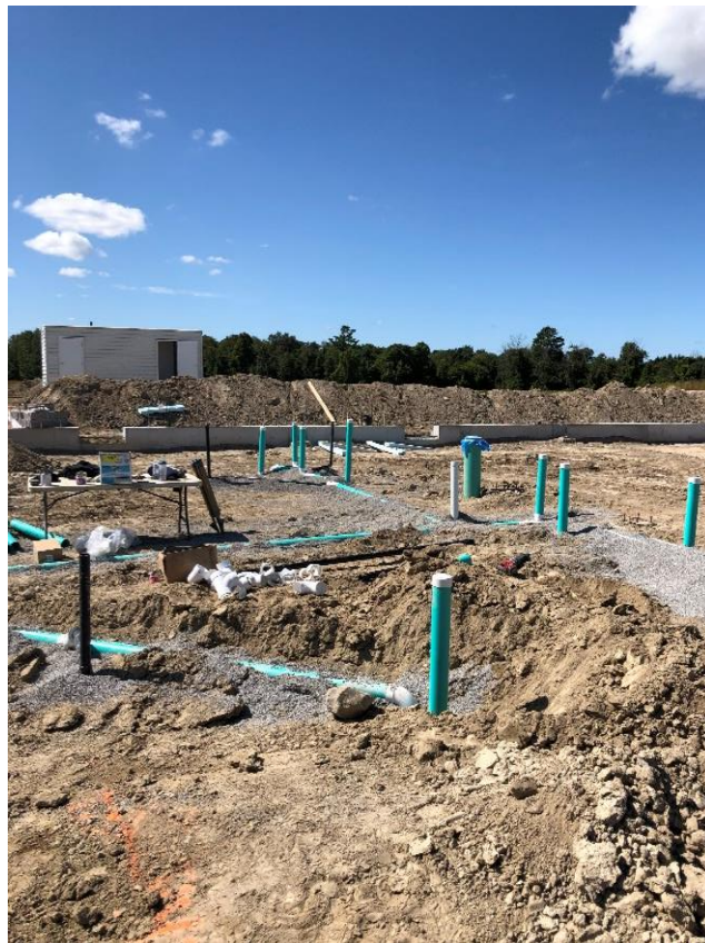
Installation of sanitary drainage under administrative area