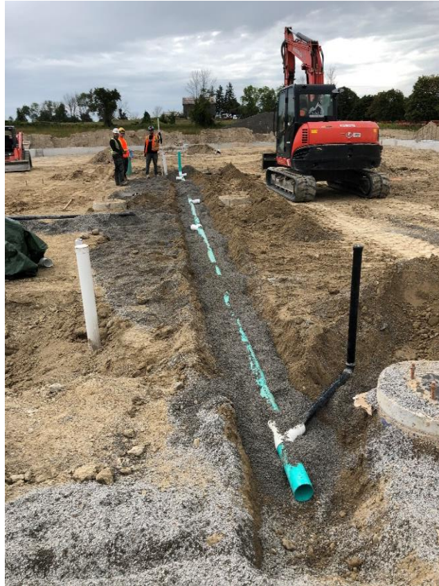
Installation of sanitary drainage under administrative area