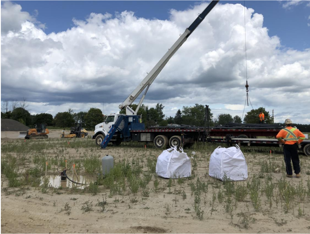
Mobilization and delivery of foundation steel