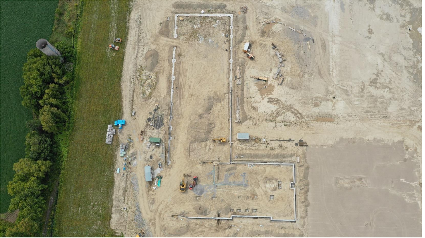
Direct aerial view of Operations Centre building footprint