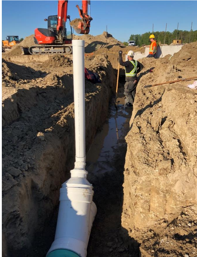
Installation of main storm water drain under administrative area