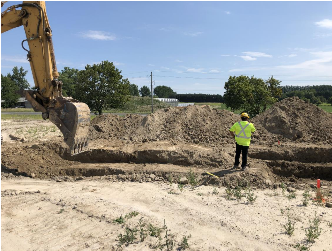
Excavation building foundation footings along eastern elevation