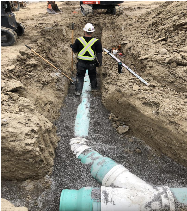
Installation of main storm water drain under administrative area