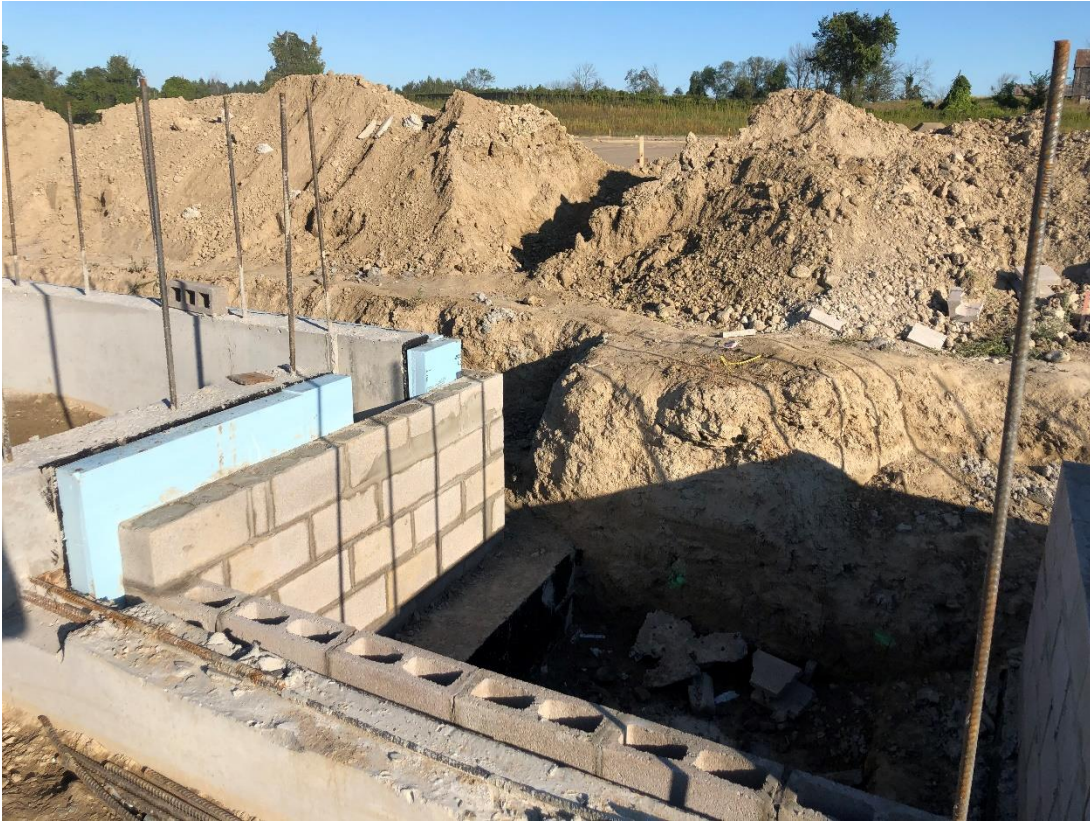
Foundation masonry and insulation along eastern elevation