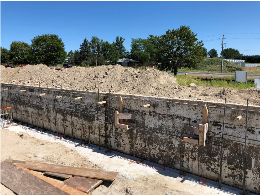
Forming foundation wall along eastern elevation