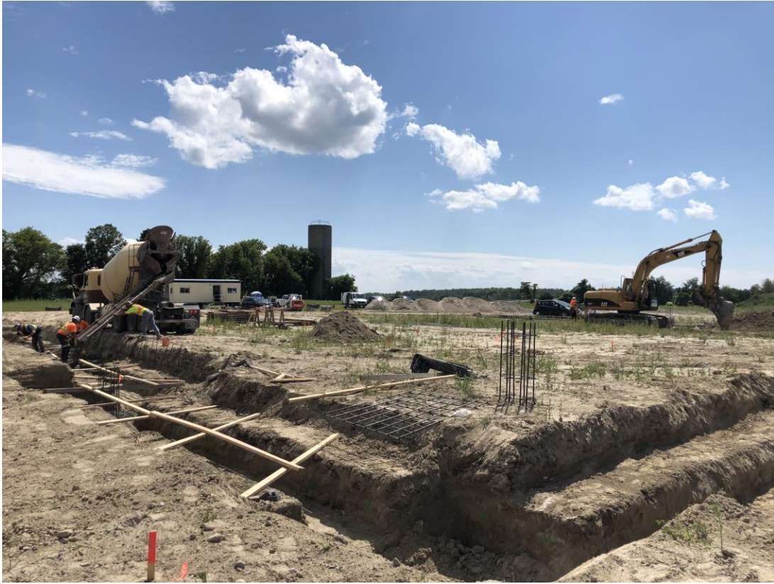
Excavation, reinforcing and pouring concrete foundation footings along N/E elevation