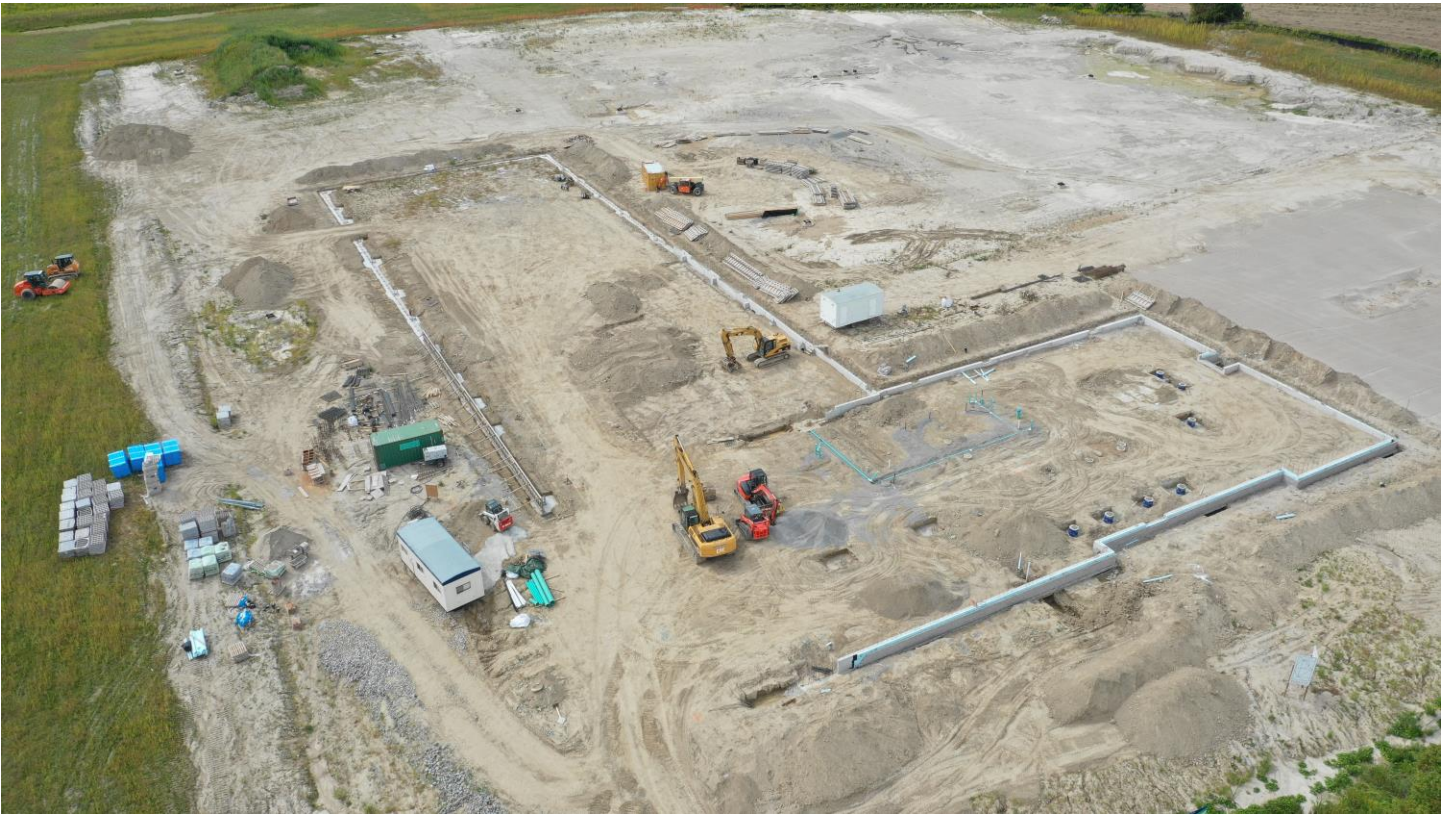
Aerial view looking west of Operations Centre building footprint