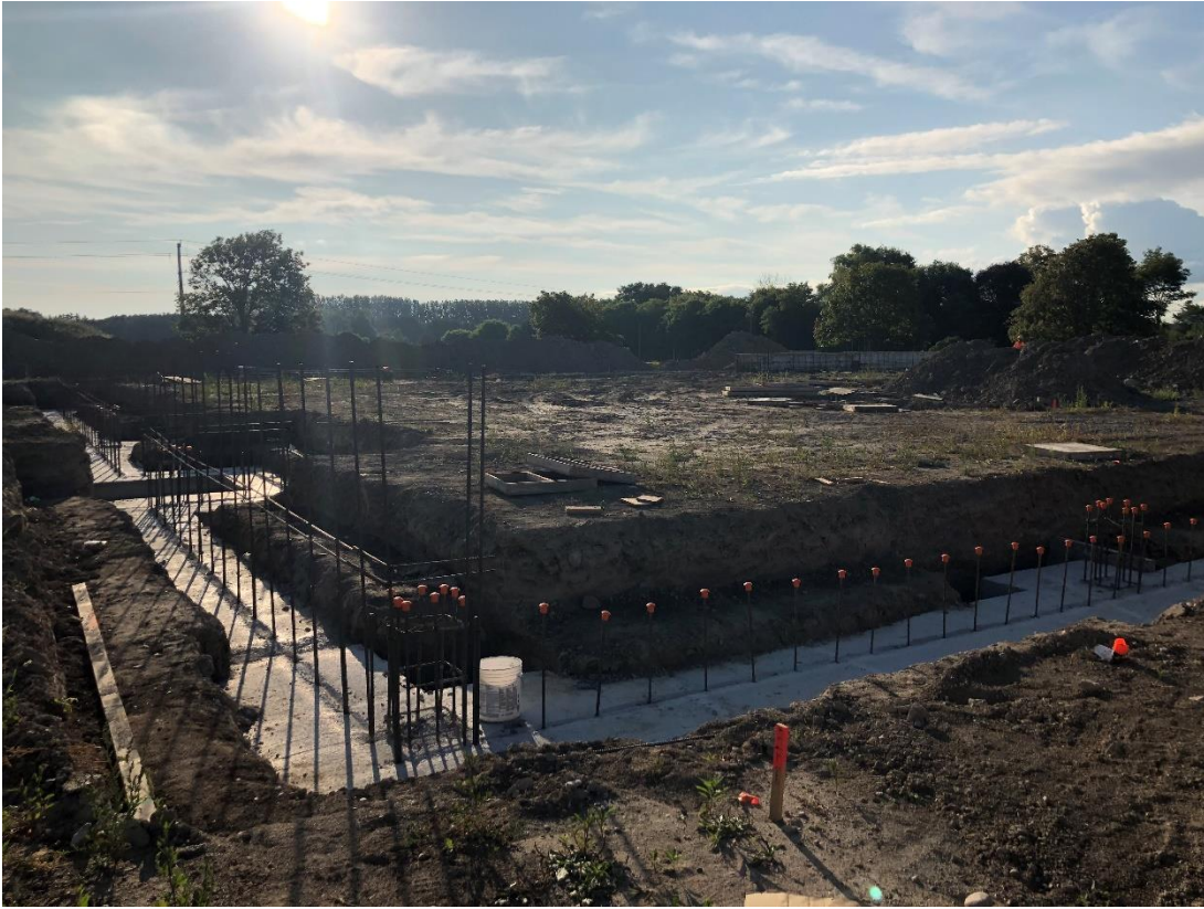
Building foundation footings and rebar along north elevation