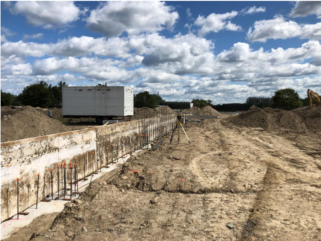
Forming foundation wall along north elevation service bays