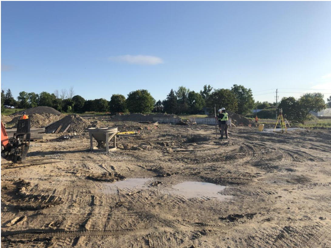
Surveying and staking foundation piers along administration section of building