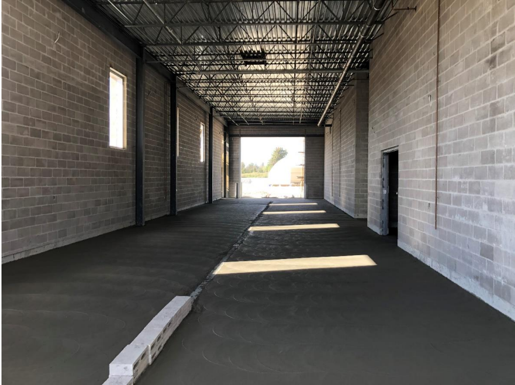
Completed slab on grade concrete pour for the Wash Bay