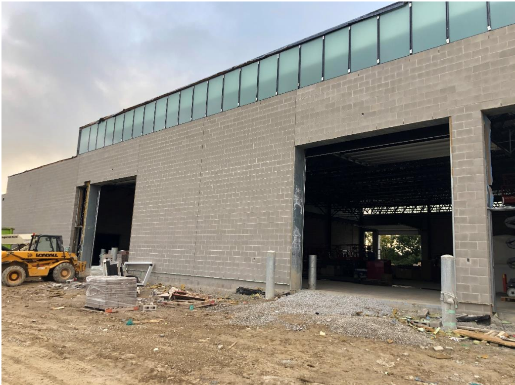
CPRC & Water bays north elevation with brick veneer and glazing