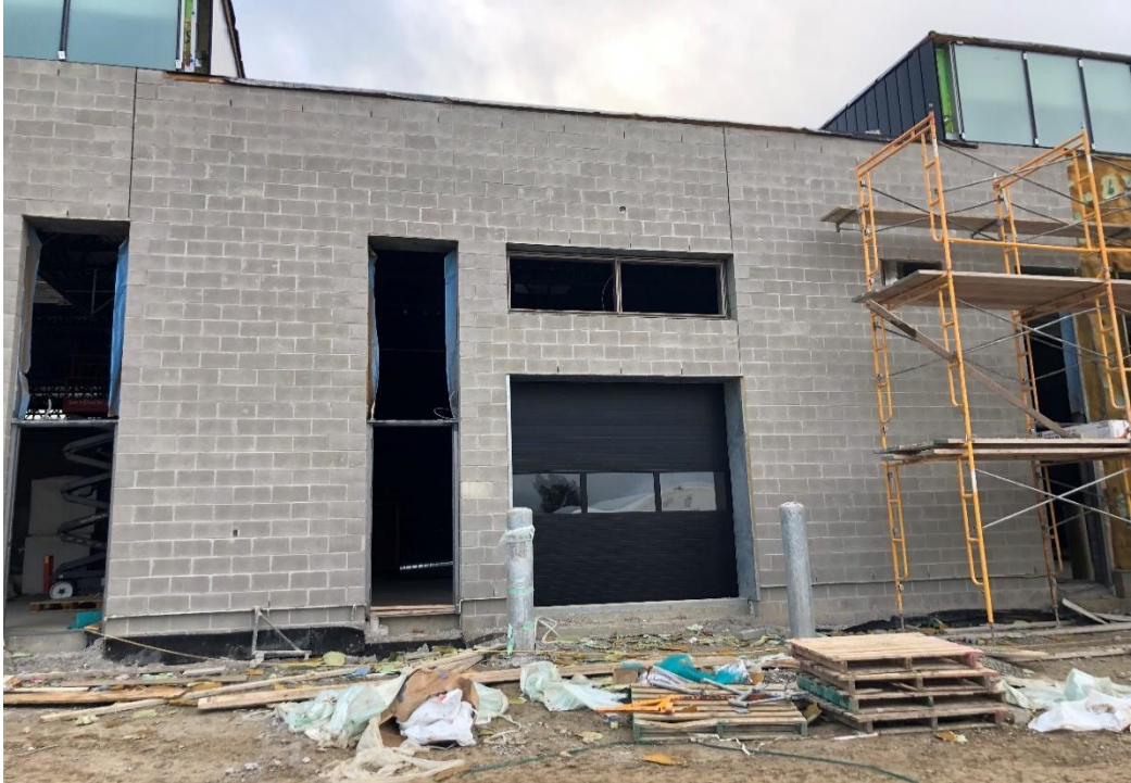
Overhead door and brick veneer north elevation of Carpentry workshop