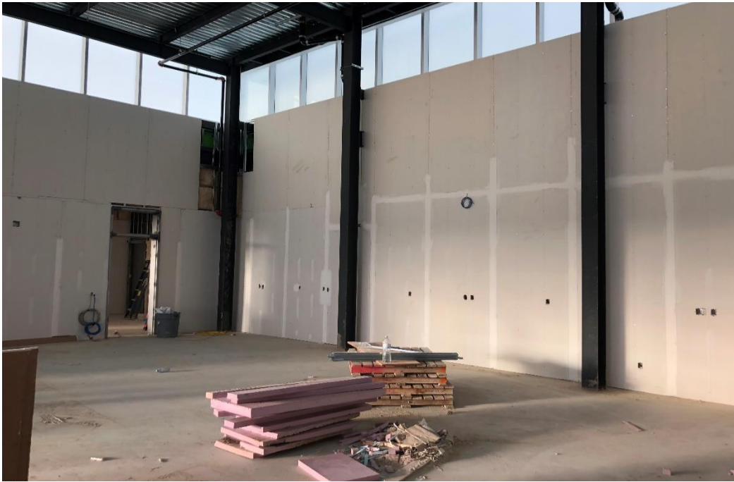
Drywall and glazing in the administration area main lobby