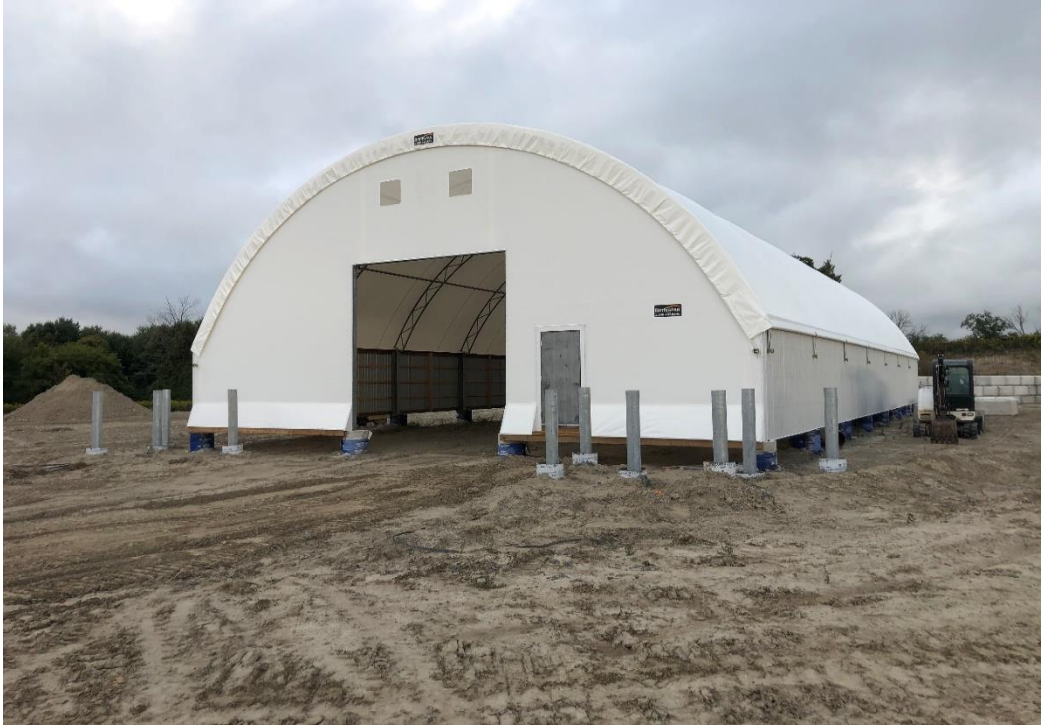
Exterior cover storage building north end of site