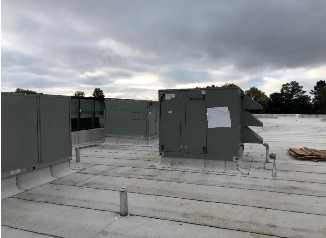
Placement of HVAC rooftop units over the administration area