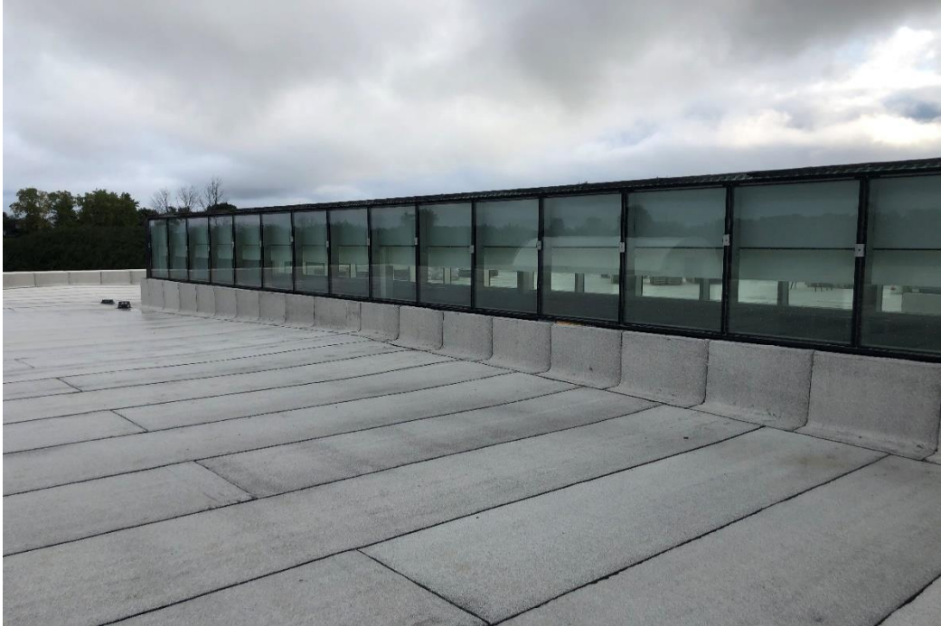
Completed roofing and clerestory over the administration area