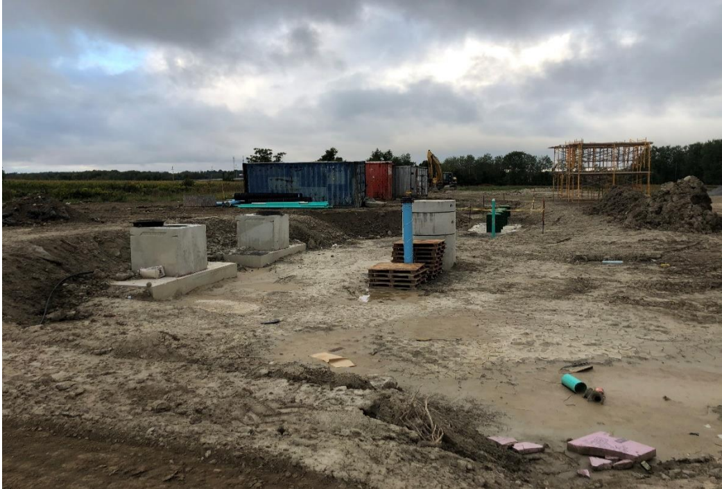
Fire water cisterns and pump shaft placement