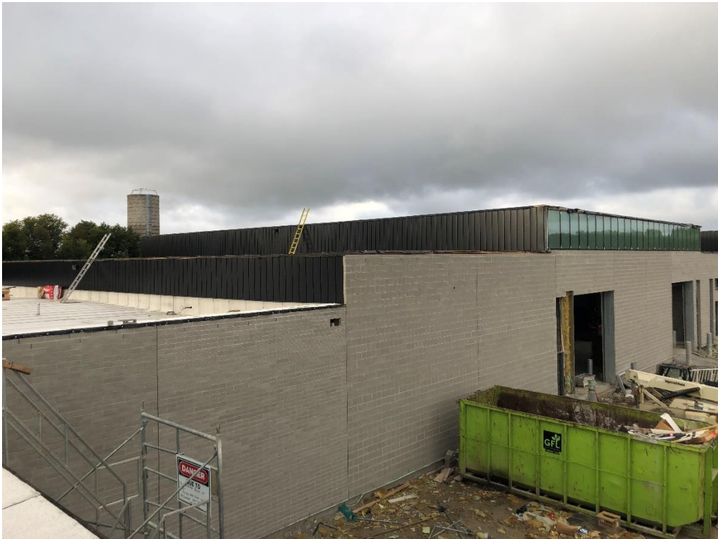
Roofing and finished siding over the service bays