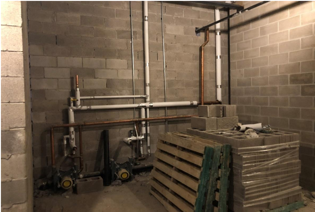
Interior masonry block and mechanical installation for women's changeroom