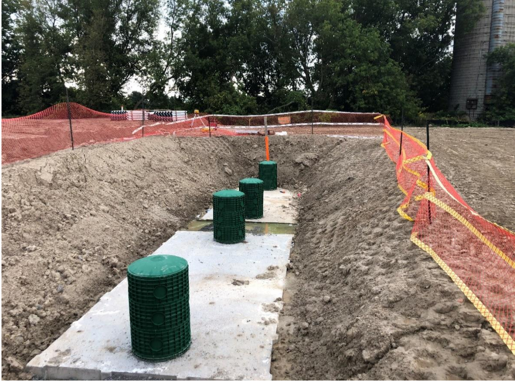
Installation of septic tanks south of the service access road