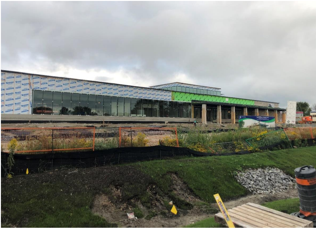
Facility east elevation view (front of house) of the Operations Centre