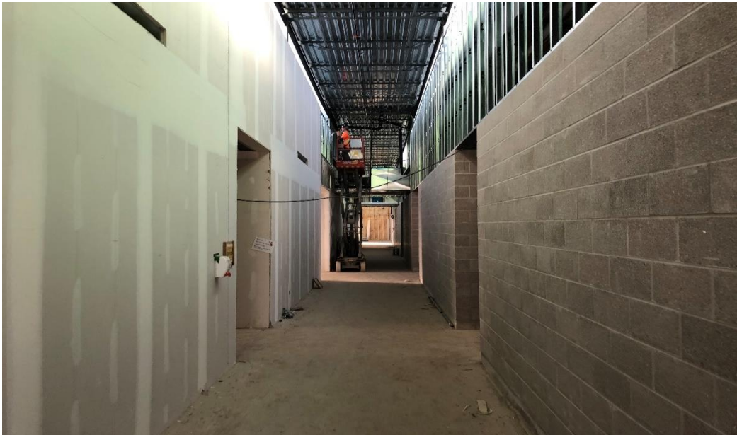
Staff north entrance corridor separating lunch room and meeting rooms