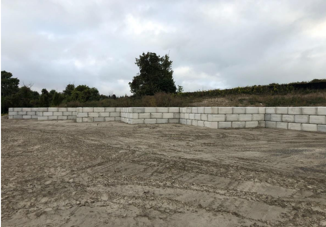
Saw tooth retaining wall north part of site for materials/garbage bins