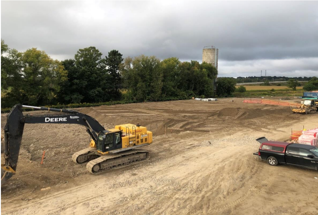
Installation of septic field south elevation