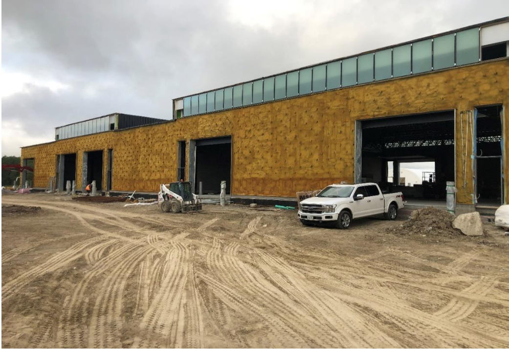
Service bays south elevation application of spray foam insulation