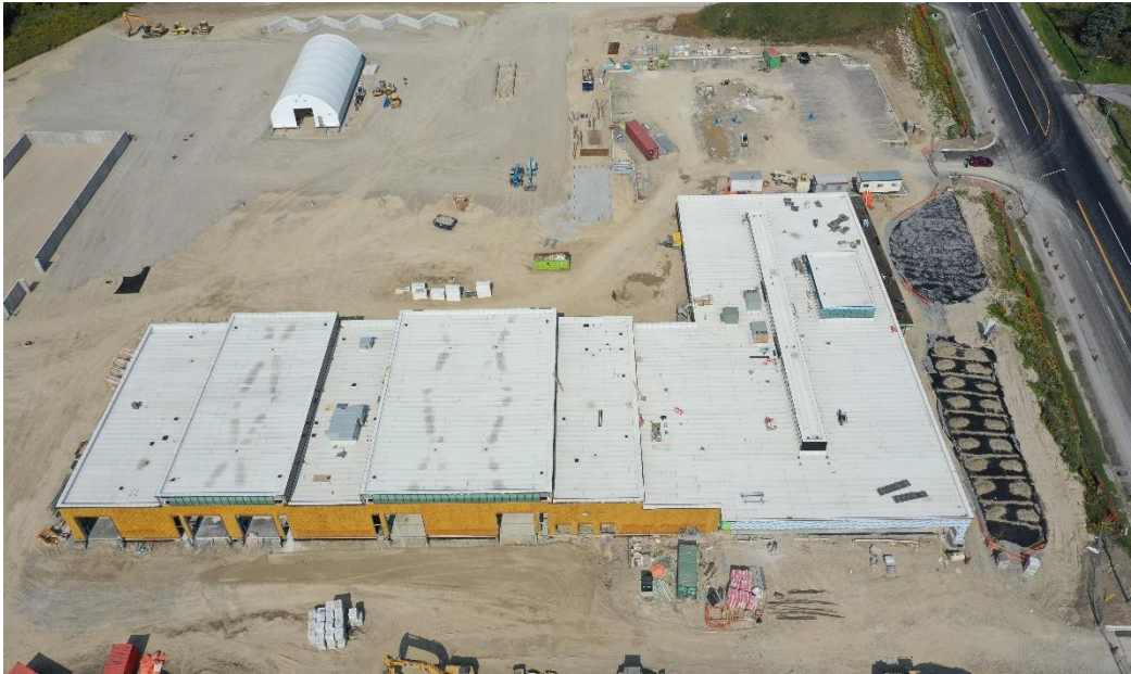
Operations Centre south elevation viewing to the north