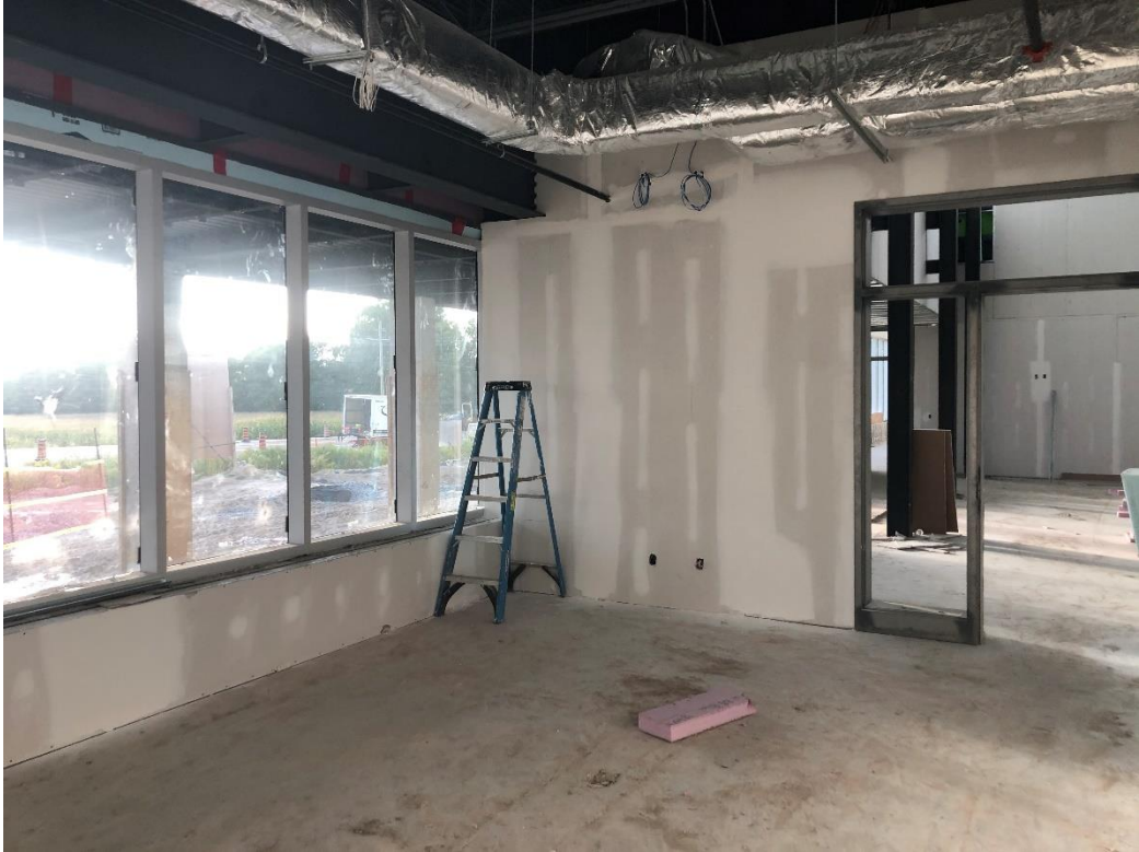
Drywall and curtain wall in the administration area meeting room