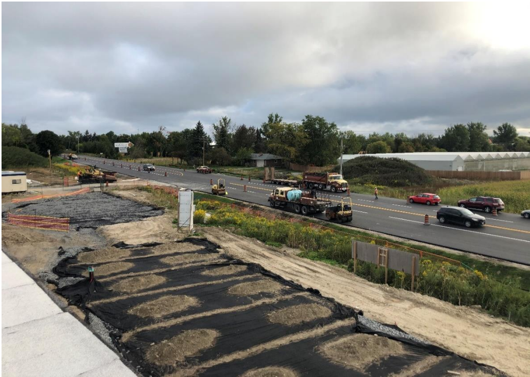
Rain water infiltration galleries and road widening slip lanes Woodbine Ave