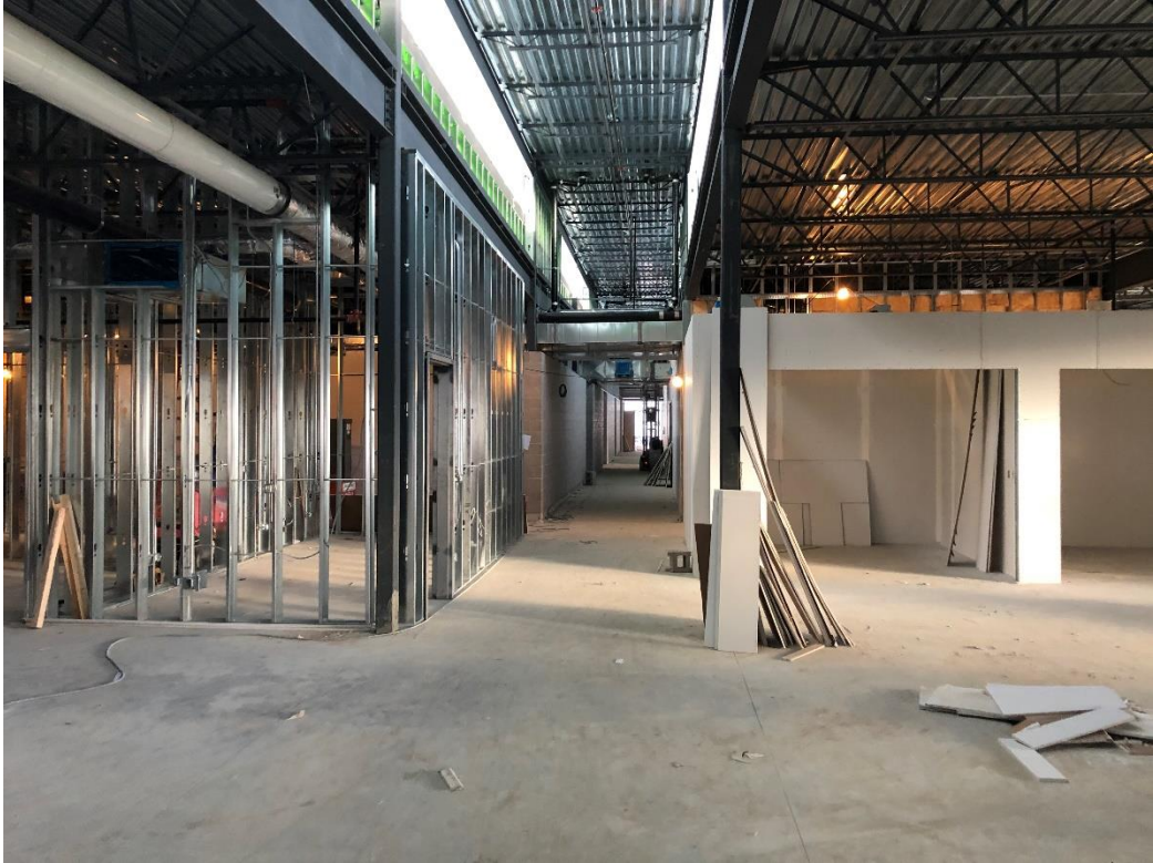
Staff corridor viewing north separating private offices in administration area