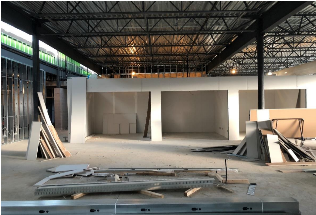
Framing and drywall of private offices in the administration area