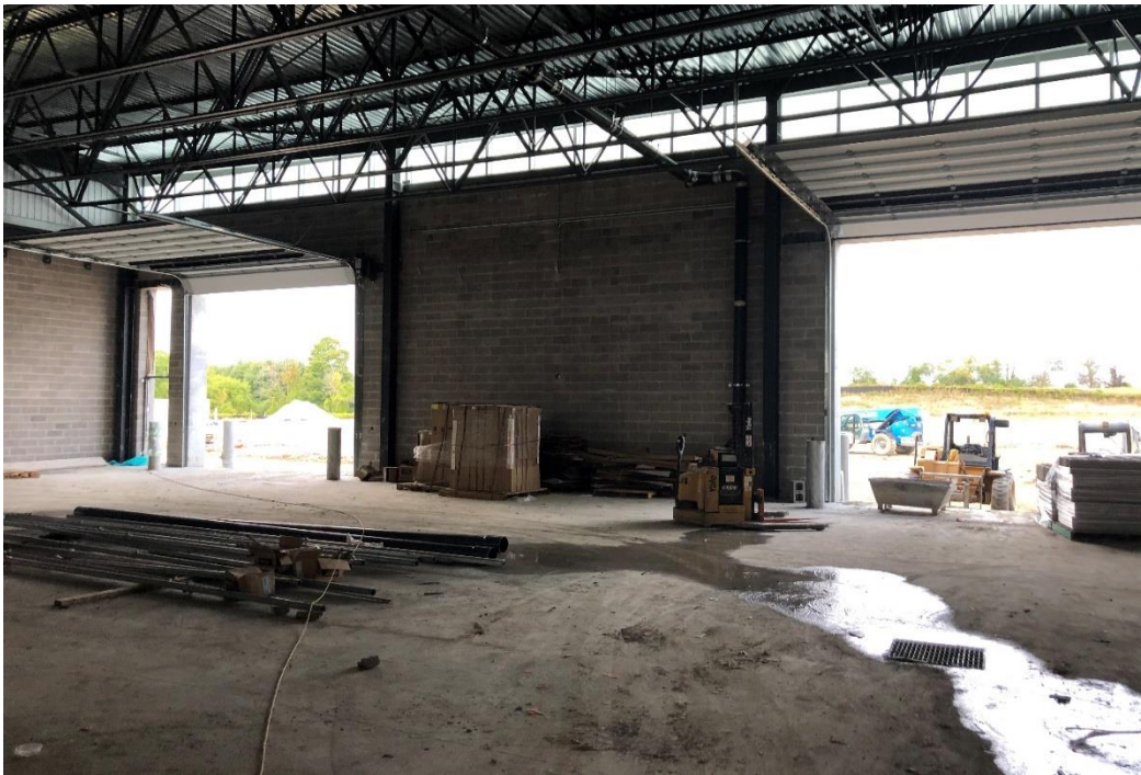
CPRC & Water bays overhead doors