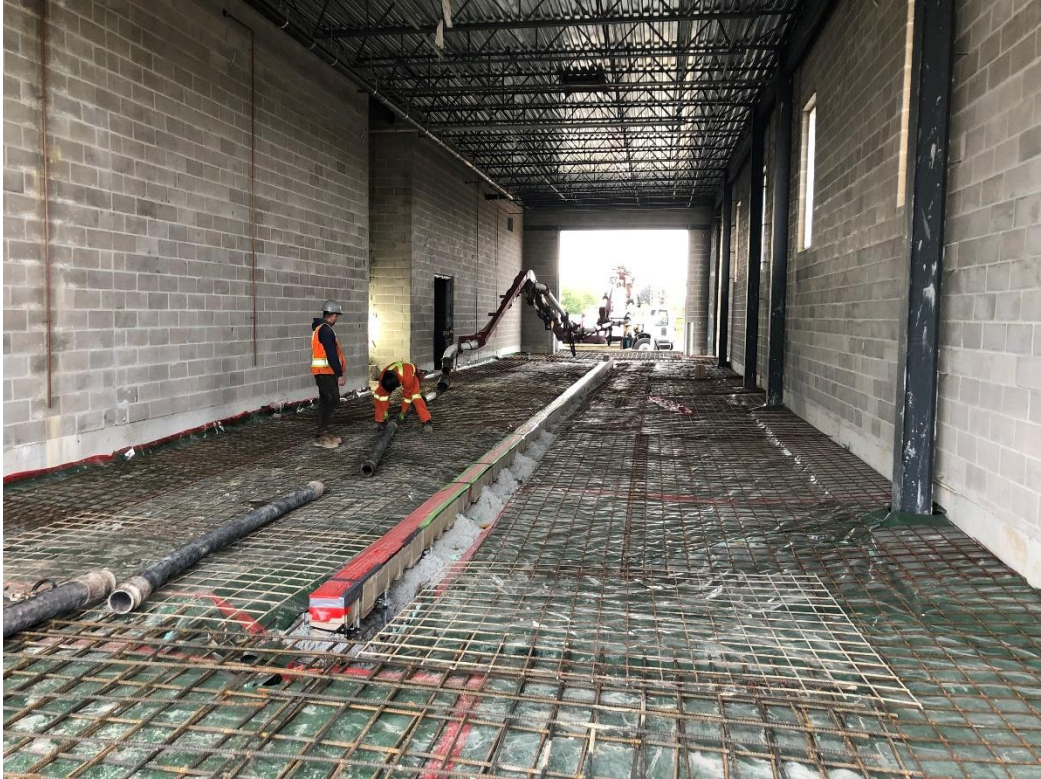
Slab on grade preparation of Wash Bay