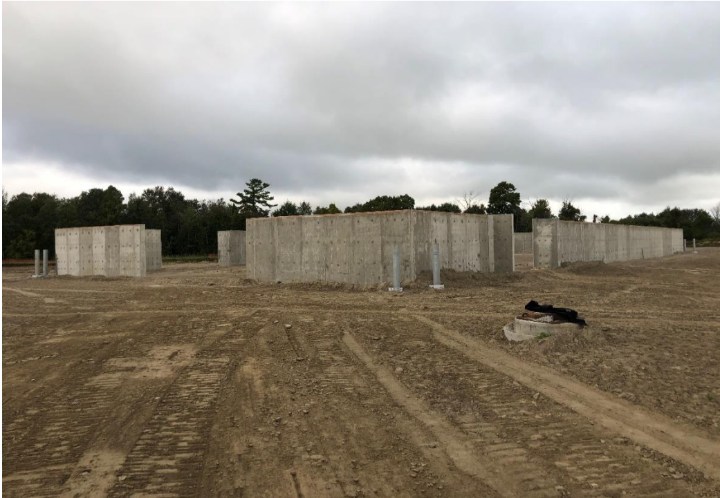
Foundations for drive through Salt dome