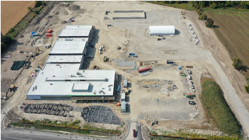
Operations Centre east elevation viewing to the west